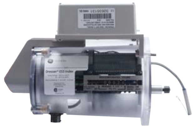
ES3 with AMR device installed