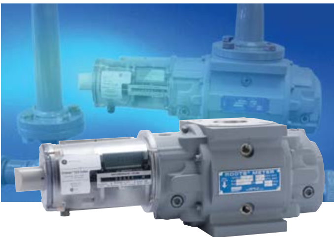
Series B meter with ES3 and AMR mounting bracket installed